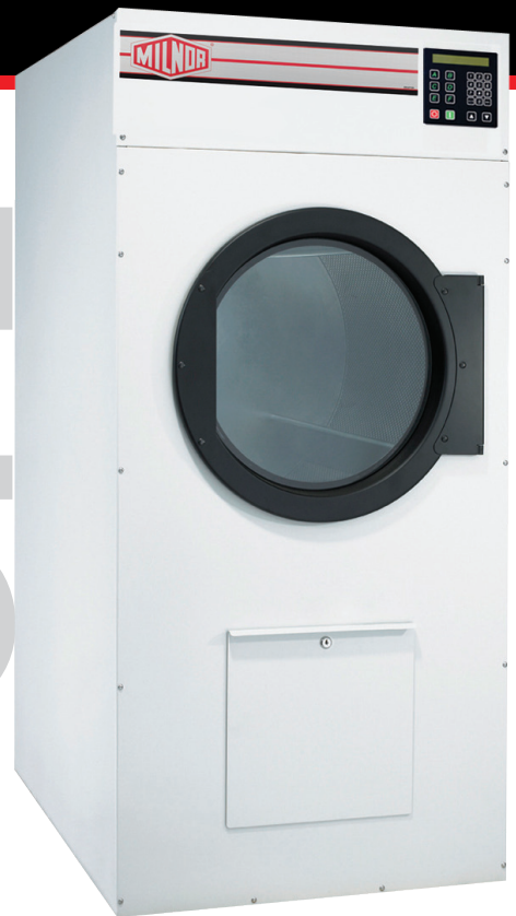
M30V OPL Dryer